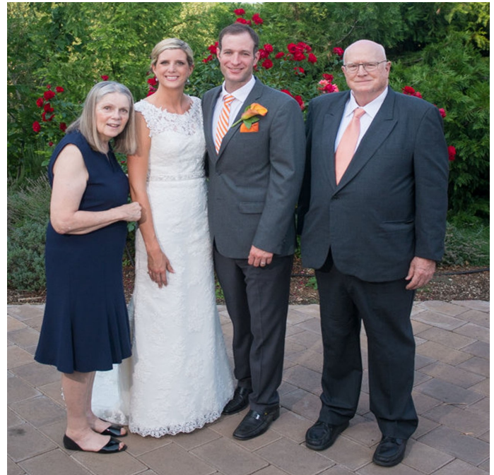
The Bride, the Groom and a couple of others.